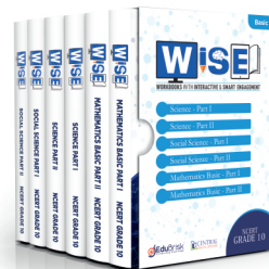
Grade 10 Basic Kit